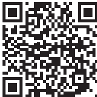
Obra Social Report 2023